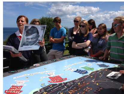
Students visit the Normandy American Cemetery and Memorial.