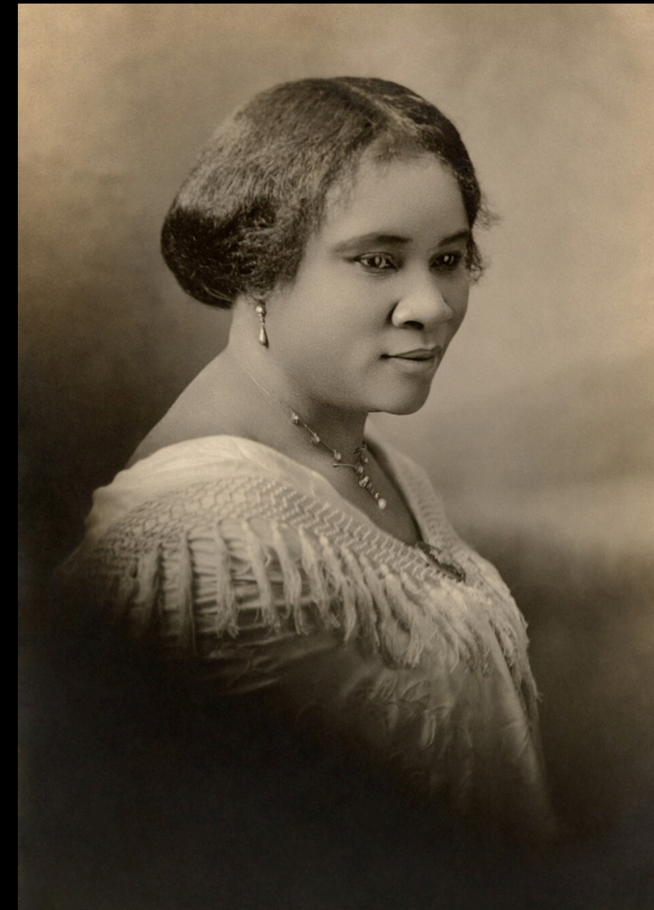
MADAME C.J. WALKER