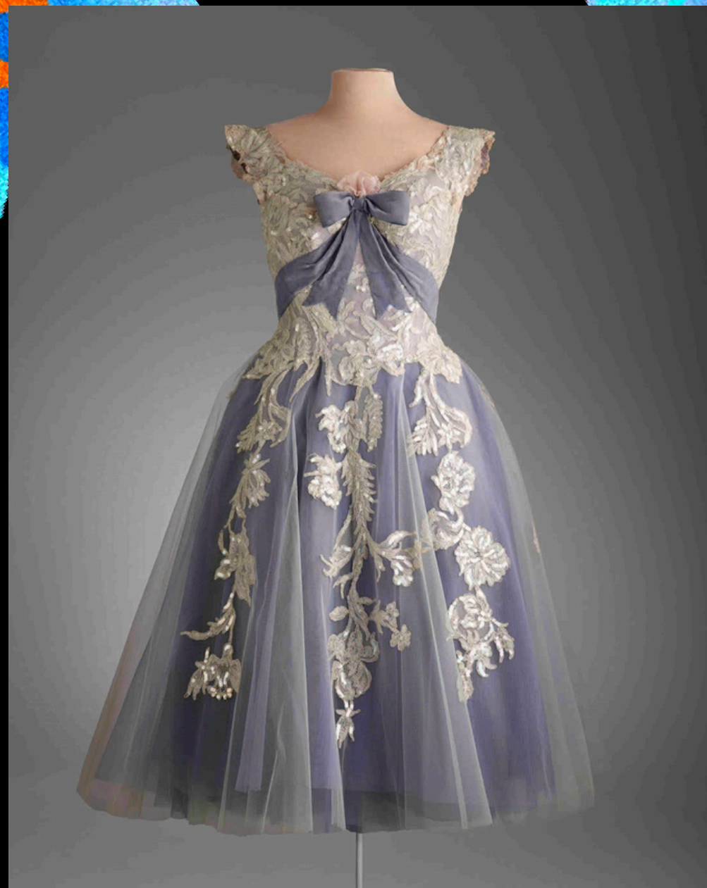
DRESS WORN BY MARJORIE MERRIWEATHER POST CIRCA 1954-1956