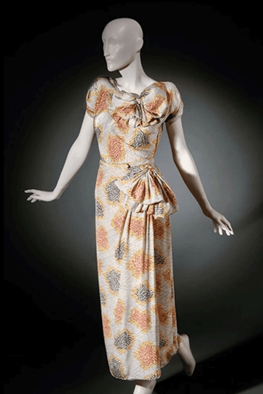
PRINTED SILK DRESS AND BELT CIRCA 1935-8