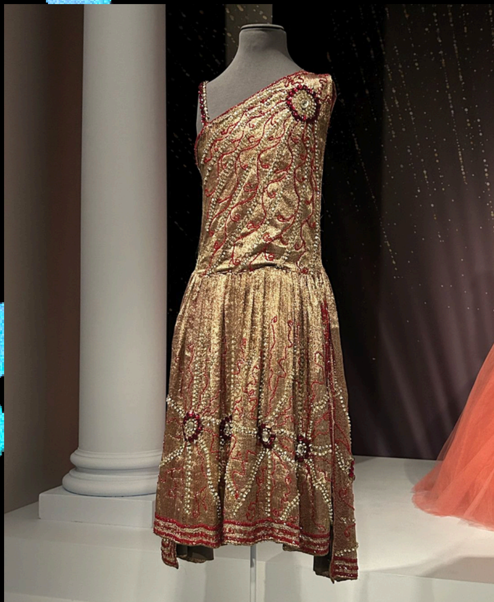
GASPARILLA COURT GOWN CIRCA 1926