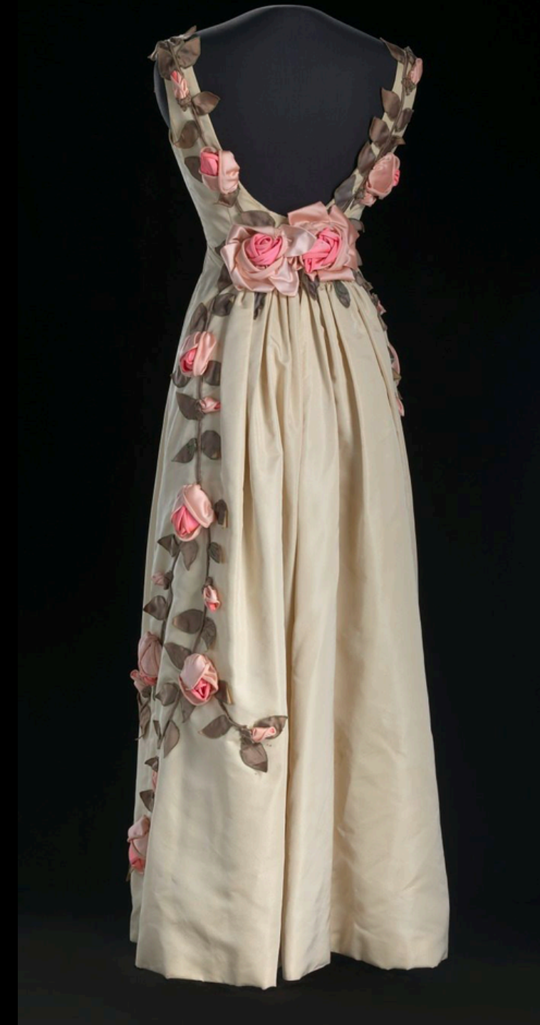
“THE AMERICAN BEAUTY” DRESS CIRCA 1966-7