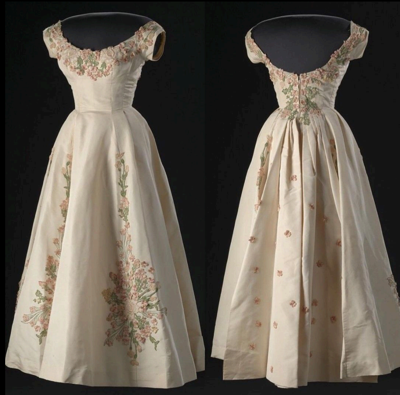
SILK APPLIQUE DRESS CIRCA 1958