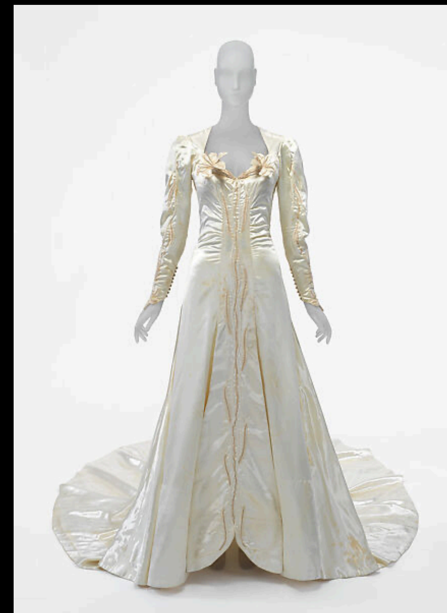
WEDDING DRESS CIRCA 1941