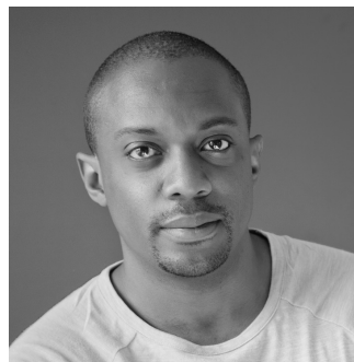
Hank Willis Thomas

cover image: Hank Willis Thomas The truth is I am you: The truth is I love you (Arabic), 2015 MetroTech Promenade in Brooklyn, New York aluminum lamppost sign with vinyl graphics on both sides 36 x 36 x 1 1/2 inches Courtesy of the artist and Jack Shainman Gallery, New York.